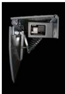
Stored traffic position

The MD-CM Series edge-of-dock leveler from Blue Giant is ideally suited for applications where installation of pit levelers is not feasible or where standard fleet bed heights are serviced at the loading dock. The MD-CM Series is easily installed to the dock face providing an efficient self storing docking unit, replacing cumbersome dock plates.