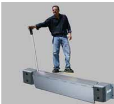
Insert comfort grip handle